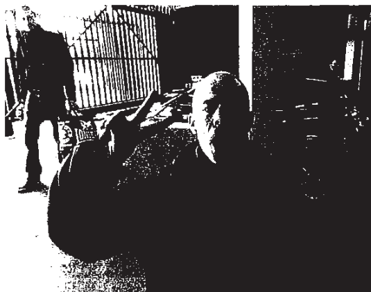
Aggressive street drinker refusing to leave Glossop Road Baths parking area, when caught having a drinking session and asked to leave 3 rd May 2016