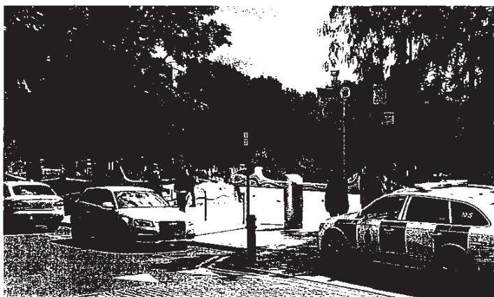
Ambulance crew attend street drinker incident on Devonshire Green