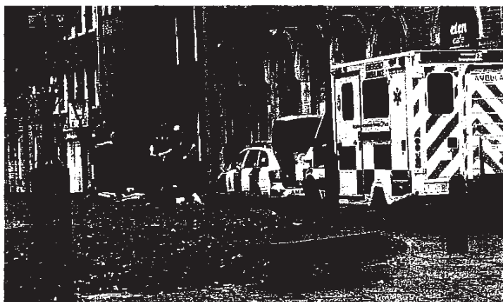
Ambulance crew attends street drinker incident by Sheffield Cathedral