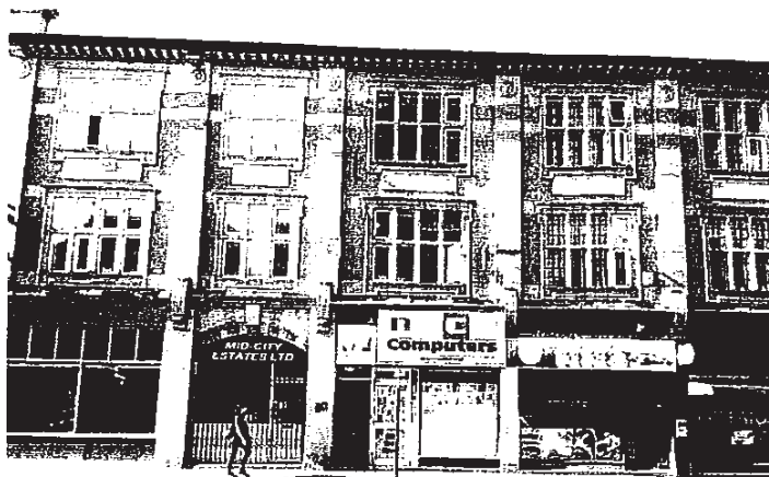
N2C Shop in West Street – the site for the Aslan Application