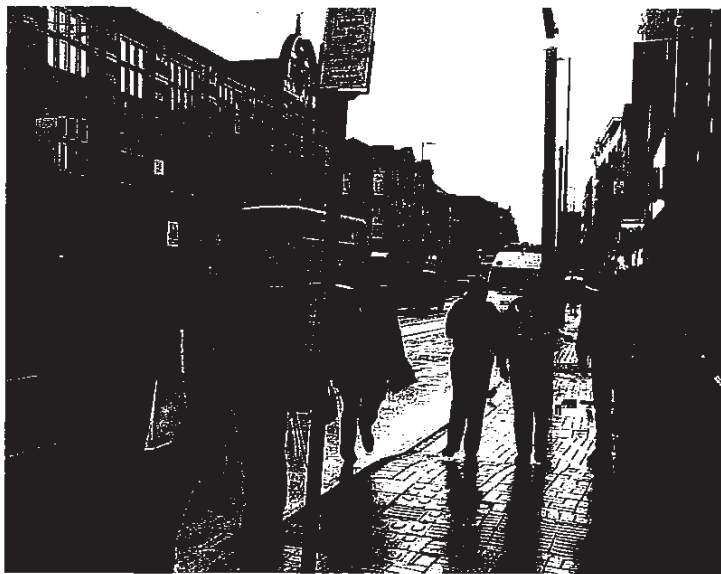
Police attend street drinker incident at West Street bus stop N2C shop – proposed 3 rd off-licence – is opposite in photo