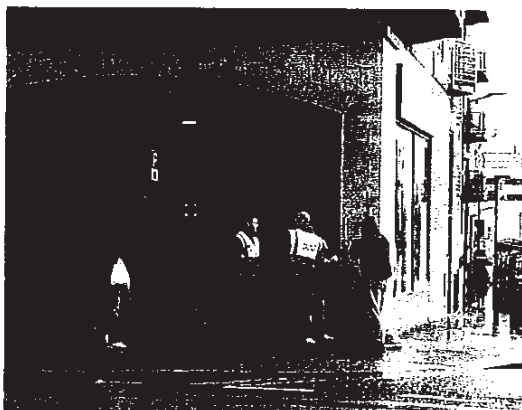
Ambassadors attend altercation amongst street drinkers outside West Street Tesco