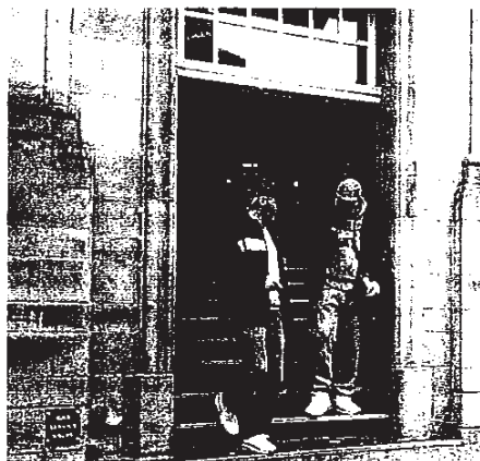
Street drinkers using Glossop Road Baths apartment entrance as meeting place, drinking venue, urinal and drug-taking location (see comments by residents)