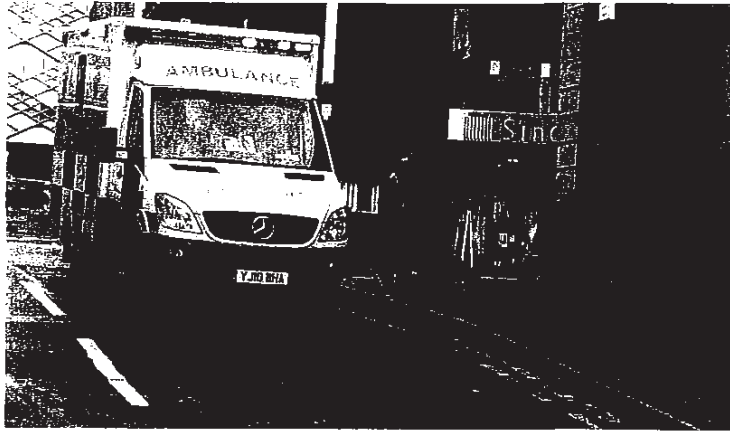
Ambulance crew attends street drinker incident on Cavendish Street/West Street