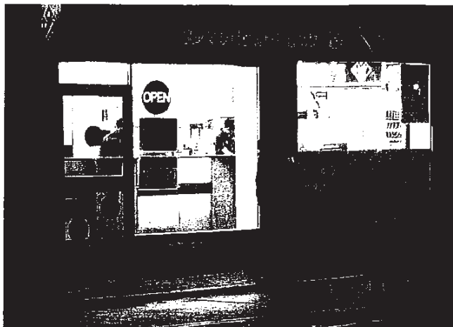
Police attend to street drinker on West Street