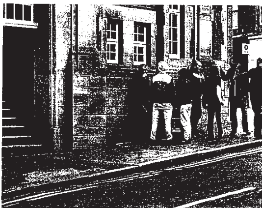
Street drinking group at West Street/Cavendish Street junction (see comments about drug dealing in this area)